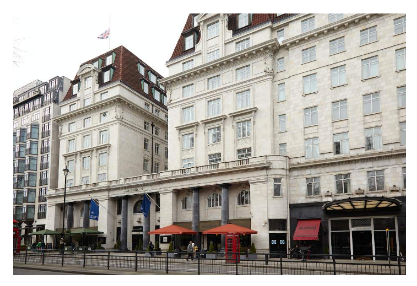
Above: Sheraton Grand Park Lane hotel, Mayfair, London

For more information on Brintons and its range of products and services for the commercial sector, visit <u>www.brintons.net</u> or call 01562 635665.